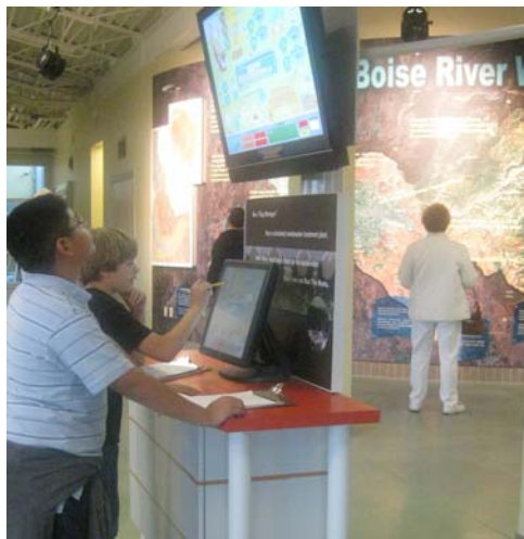
Students enjoying the WaterShed exhibits www.BoiseEnvironmentalEducation.org

ment plant tour at 1:00 p.m. No pre-registration is required (unless indicated) and admission is FREE!